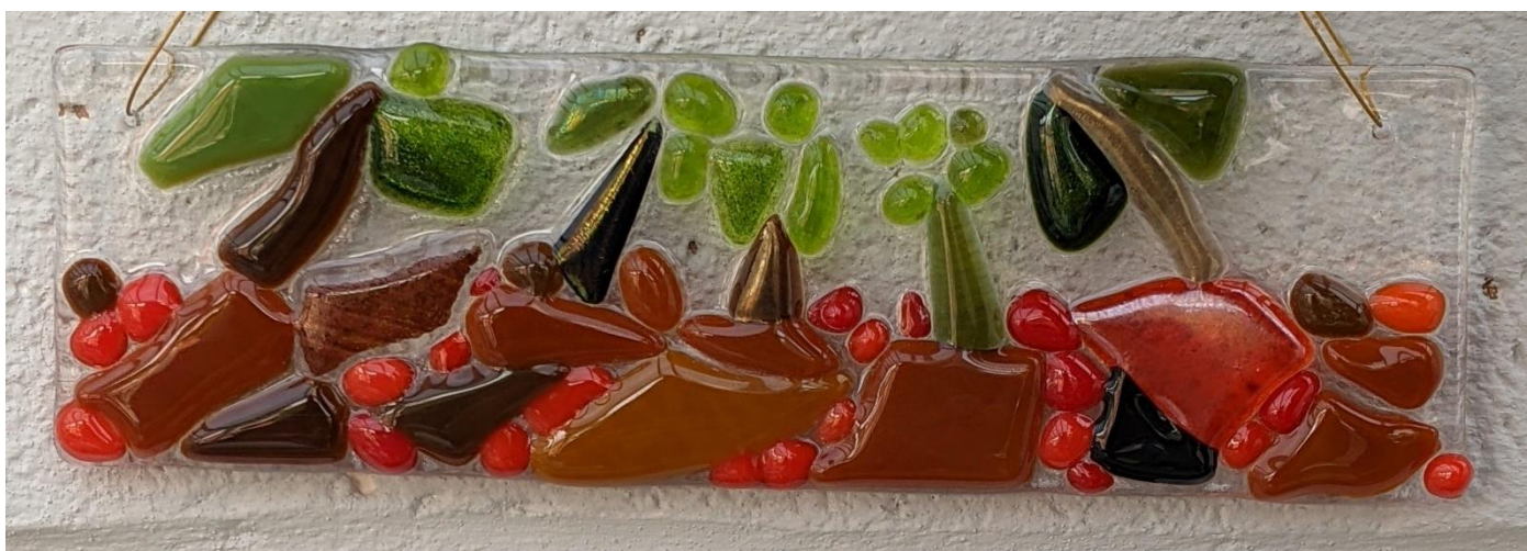
A couple of finished items unpacked, produced by Angie Baker.