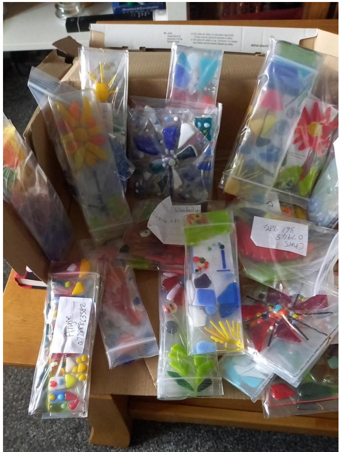
Items before firing and returned ready to go out to their creators.